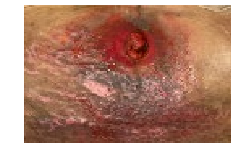
(1) Day 14

All 3 patients have not seen of same skin issues when re-admitted in the hospital.