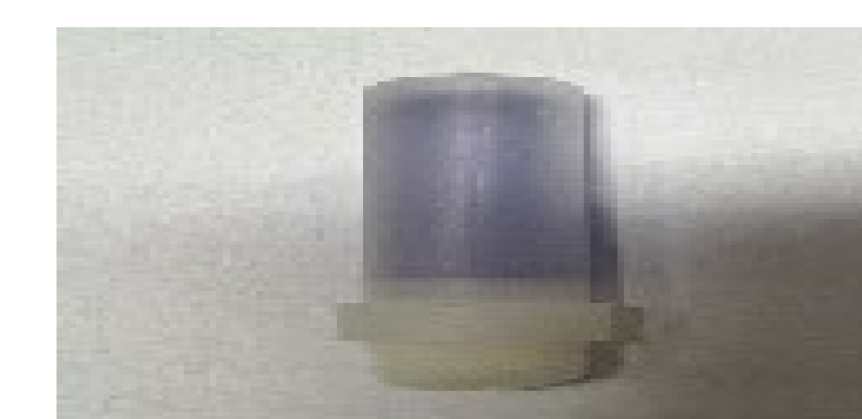
No sting cyanoacrylate skin protectant