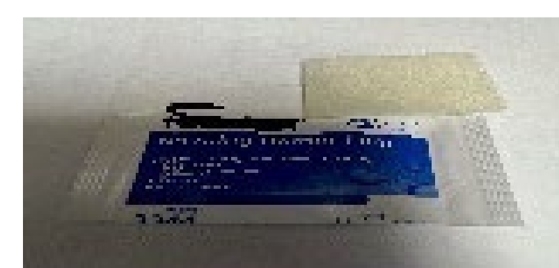
No sting barrier wipe